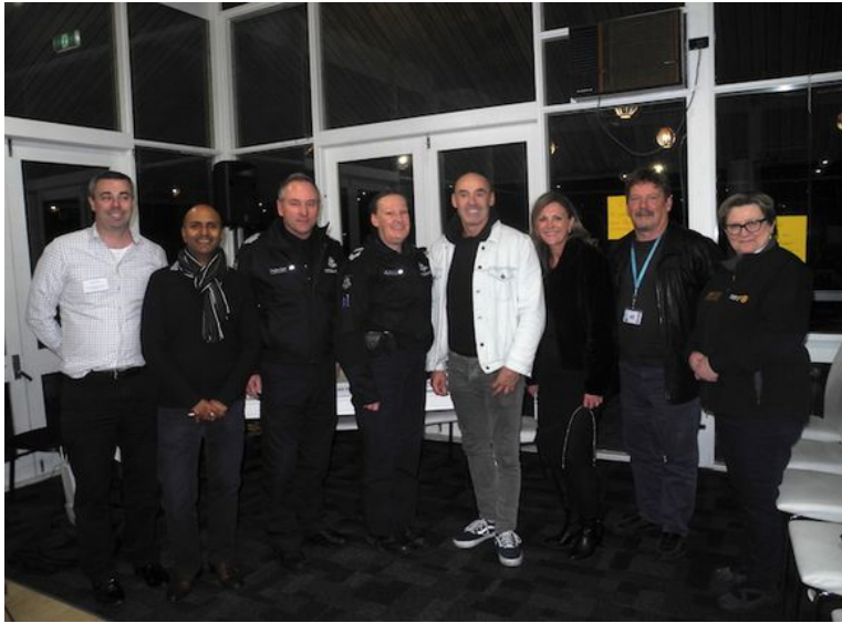
From the "You're not alone" forum Last week at the Goonawarra Golf Club